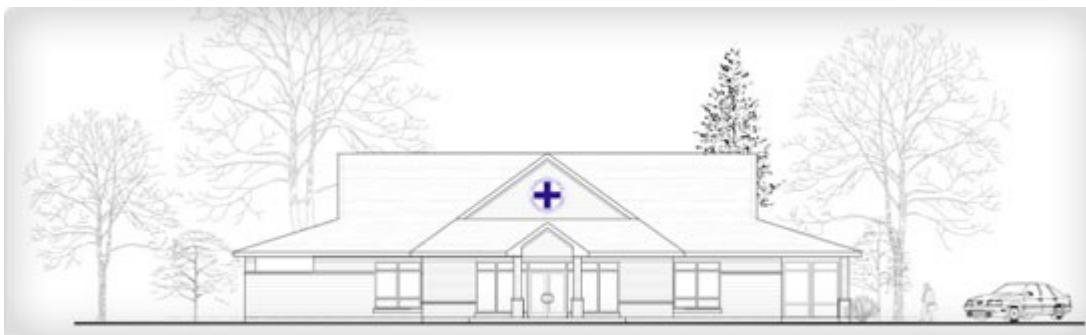
Architectural Rendering of the New Shelter